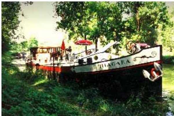
enchanted mooring area

When returning to your barge, happy and content the day's events, there is plenty of time for cocktails before your evening's candle light dinner. Beside delicious dishes and noble wines you also get to learn every evening several sorts of cheese. A wonderful opportunity to become not only a connoisseur of French specialties and grand Burgundy wines. but also an adept in French cheese art. The delightful evening can then close with drinks by the bar together with fellow passengers and new friends.