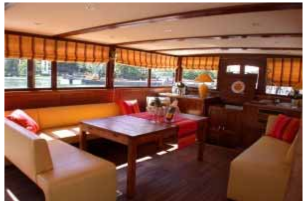
wheel house salon