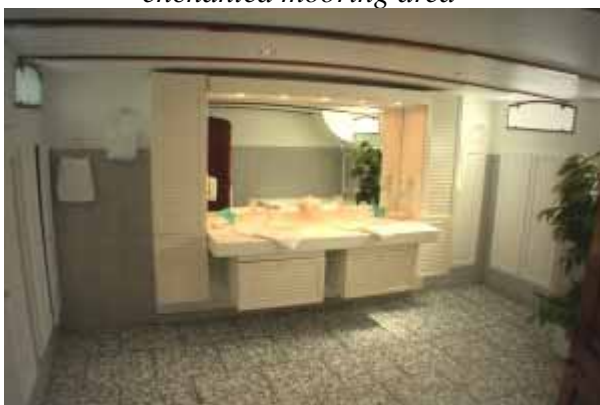
bathroom imperial suite