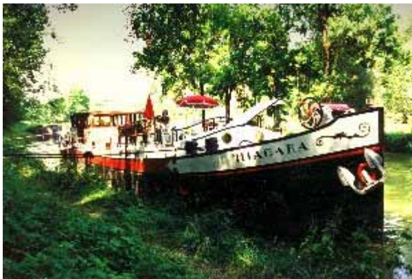
enchanted mooring area

When returning to your barge, happy and content the day's events, there is plenty of time for cocktails before your evening's candle light dinner. Beside delicious dishes and noble wines you also get to learn every evening several sorts of cheese. A wonderful opportunity to become not only a connoisseur of French specialties and grand Burgundy wines. but also an adept in French cheese art. The delightful evening can then close with drinks by the bar together with fellow passengers and new friends.